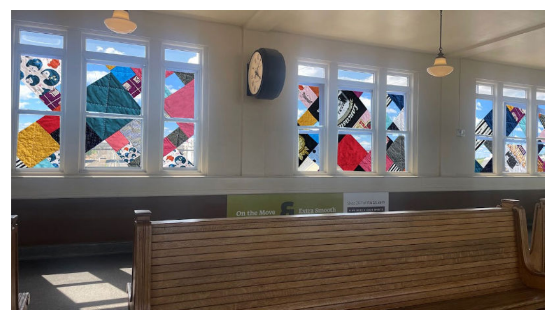
Digital rendering of proposed quilt window design