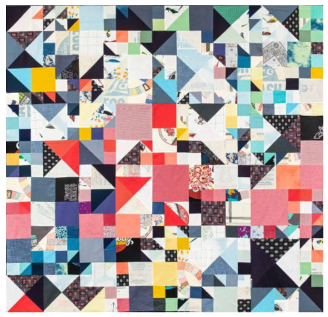
Front side of the quilt that will be manipulated to fit the windows.

"A Place for Every Piece" is centered around an improvisational patchwork quilt, designed specifically to fill the station's 16 window bays by artists Jill and Libby. Using locally sourced materials, including discarded clothing and textiles from Lancaster County, the artists combine vintage and modern fabrics to infuse the piece with authentic elements of local life. The patchwork design is photographed, enlarged and manipulated through a subtractive process, then applied to the concourse windows with translucent vinyl, allowing the cityscape to become part of the quilt's pattern.