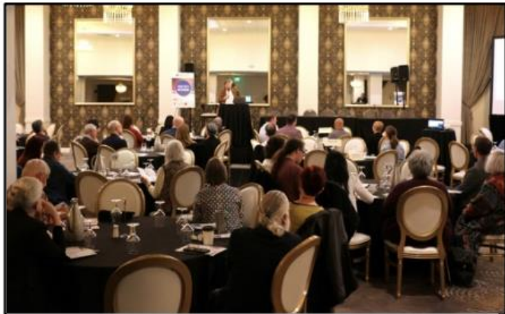
2023 Age-Friendly Lancaster Summit at the Lancaster Holiday Inn

In addition to providing the annual update on the Age-Friendly Action Plan projects, plenary and breakout sessions featured age-friendly housing solutions that are, or could be , part of our community that meet older adults’ needs, affordability, and preferences.