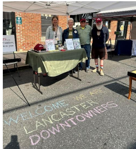
Above: Lancaster Downtowners promote Yellow Dot at Open Streets in May 2023.