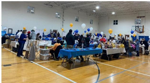
Right: United Way of Lancaster County promotes Yellow Dot and supports attendees updating their emergency medical information and contacts in their smart phones at the Brightside Opportunities Center Health Fair in April 2023.

The following chart tracks progress made with the Communication: Coordination and Outreach Project during Year Two of the Lancaster City Age-Friendly Action Plan Implementation.