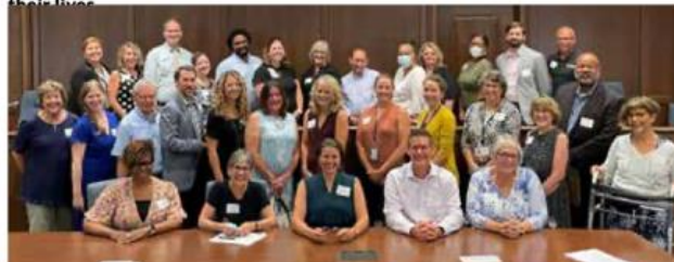
Lancaster's Age-Friendly Advisory Committee

Age-friendly considerations have been an important part of the comprehensive planning process since the start. Cross-cutting intergenerational perspectives were included in each of the eleven policy area study sessions. Applying this lens in the comprehensive planning process ensures that our community will be a good place for everyone throughout their lives.