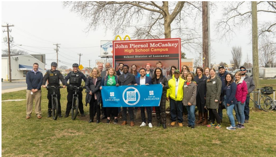
City of Lancaster Staff, Elected Officials, Age-Friendly Leadership, and Community Members celebrate the award of the $12.7 million dollar Safe Streets for All Grant at J.P. McCaskey High School on March 17, 2023.

An age-friendly representative was part of the selection committee and reviewed Request for Proposals (RFP) to facilitate the implementation of the grant funds. To date there have been improvements made at 45 different intersections.