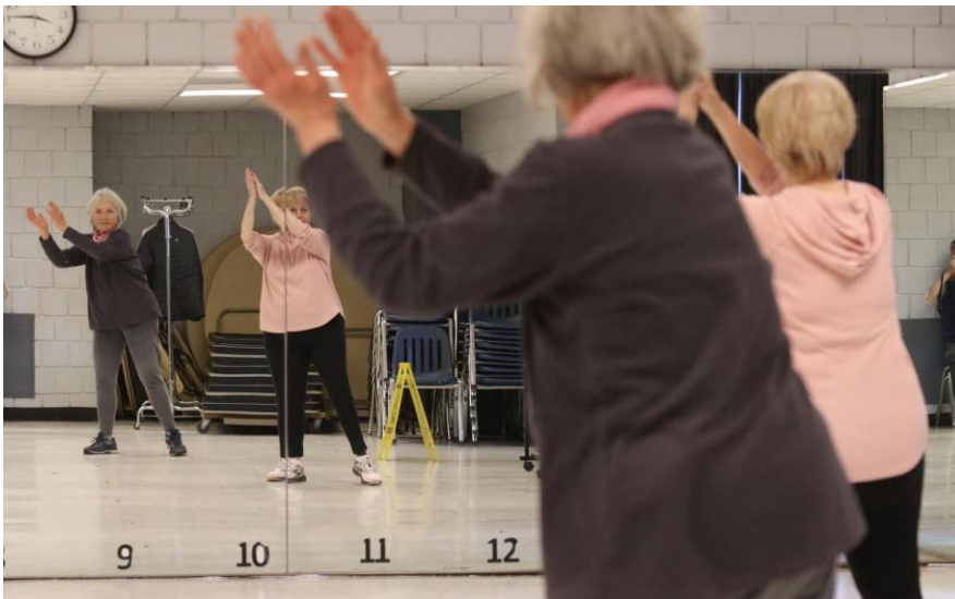
Young and old learn dance at the Lancaster Rec Commission in Lancaster, on Monday, May 1, 2023. The dance is part of Age Friendly Lancaster City Intergenertional Connections Project.

KARYL CARMIGNANI FOR LNP | LANCASTERONLINE May 10, 2023