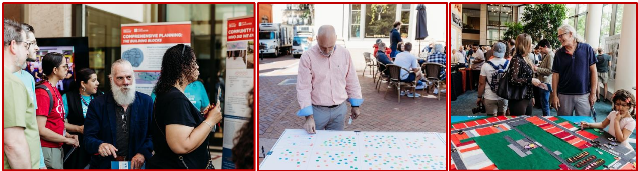
Events engaged residents of all sectors and ALL AGES during the Comprehensive Planning Process.

Every Key Activity in this Action Project was designed to incorporate the age-friendly lens into the City's current process of developing its first new comprehensive plan in 30 years. Over and above using the age-friendly lens to consider housing policies, the City's Planning Bureau considered the needs, perspectives, and assets of residents of all ages in all aspects of the Comprehensive Plan to assure Lancaster City continues to be a great place to grow up and grow old!