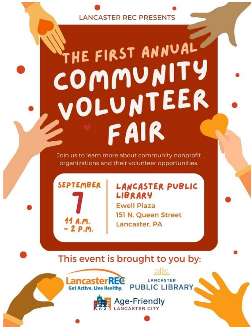
Promotional Flyer for the Community Volunteer Fair

The Community Volunteer Fair filled a gap in the community - creating a one-stop place for people to find multigenerational and intergenerational volunteer opportunities in one convenient location.