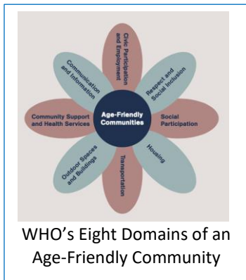
WHO's Eight Domains of an Age-Friendly Community

Age-Friendly Lancaster City is an opportunity to bring people of all ages together to rethink our neighborhoods and take action to make them more inclusive and respectful of every generation .